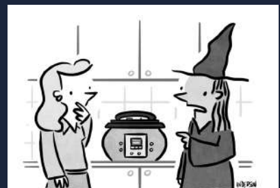
"It's one of those new Instant Cauldrons. You put a kid in here with some eye of newt and an hour later it's the best thing you've ever eaten."